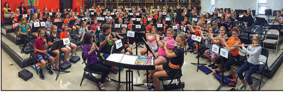
Students in 5th grade band trying out their instruments for the first time.

"Kid President." Kid President shares his positive and encouraging leadership messages via YouTube and through his popular book called Kid President's Guide to Being