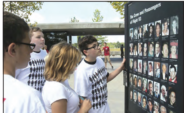
Flight 93 National Memorial - Thanks to the generosity of the HALO Foundation, students from GMS made a trip to the Flight 93 National Memorial. The students took part in a special ceremony to honor those who lost their lives on September 11th, 2001.

NASA - Students from the STEM class had an opportunity to learn from a representative from NASA in our distance learning lab. Students learned how NASA satellites are used to monitor ocean currents and how it relates to the global climate.