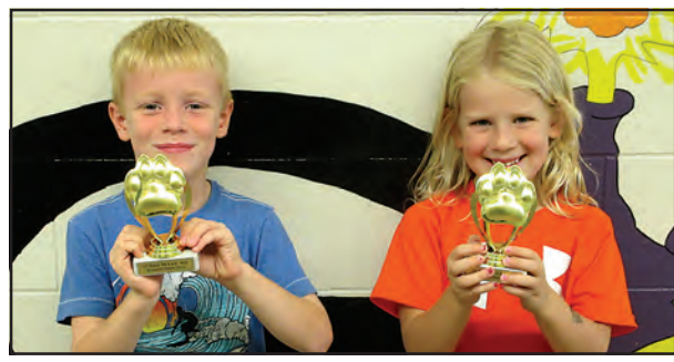
Greenwood's winners in the Bulldog Dash 5K.